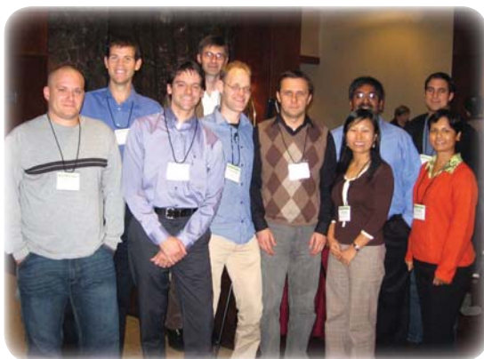
University of Chicago postdocs attending "Put Your PhD to Work" workshop in Milwaukee, October 2007

All non-faculty persons in post-PhD research capacity at the University of Chicago are automatically members of the association. Please contact us if you are not receiving notices of PDA Events.