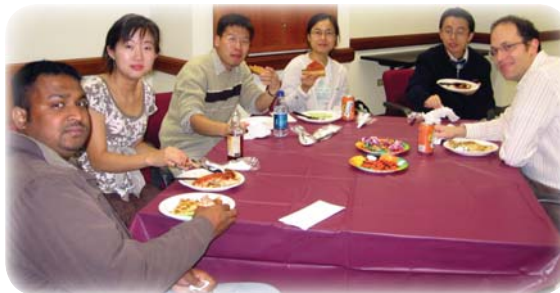
PDA Social Event, November 2007

Annual Postdoc Survey - tailoring our work to the needs of BSD postdocs