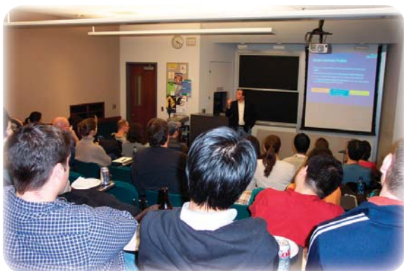
PDA Seminar Series, December 2007

See the PDA website for current contact information on how to get involved: new members are always welcome.